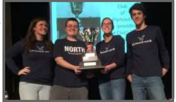
Plymouth North High School. 1st. Place winners

The Plymouth Area League held our second Civics Bee, Elections: History and Process on April 10, 2016. Originally scheduled for April 3 rd , we had to postpone due to weather conditions and safety at the facility. We were delighted to have all six teams available for the new date.